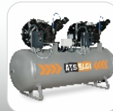
*Provision to Run Top Block Independently Based on Varied Air Demand - Demand Based Utilization