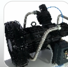
Larger Aluminium Inter & After Coolers Aiding 32% More Heat Transfer Area