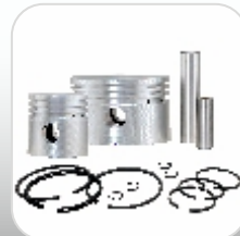
Optimized Design of Piston & Rings For Longer Life