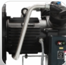
Low Operational Speed Using High Efficient IE2 6 Pole Motor