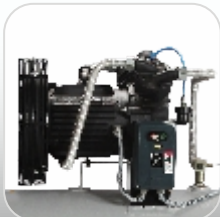
Unique Integrated Drive With Compact Top Block Design