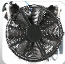
Common Cooling Fan For Energy Efficiency & Power Saving