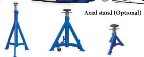
Axial stand (Optional)