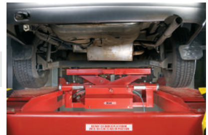
Wheels free arrangement (Jacking beam)