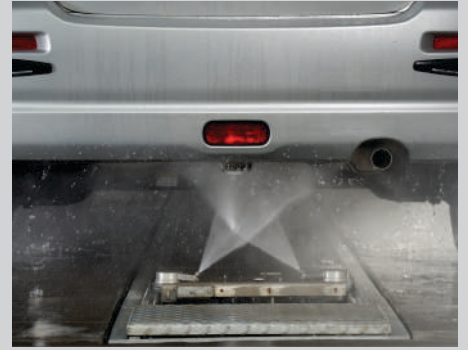
Rotating dual nozzle for better reach