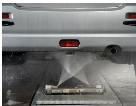
with Optional integrated UNDER CHASSIS WASHER