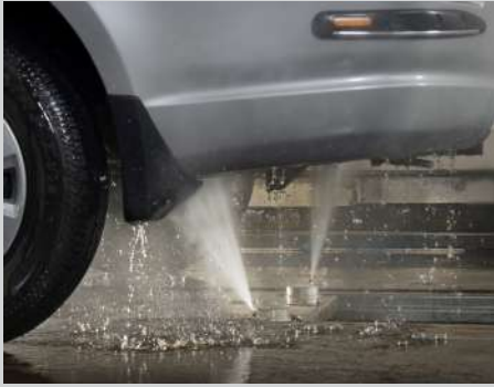
Low water consumption 24 litres per car