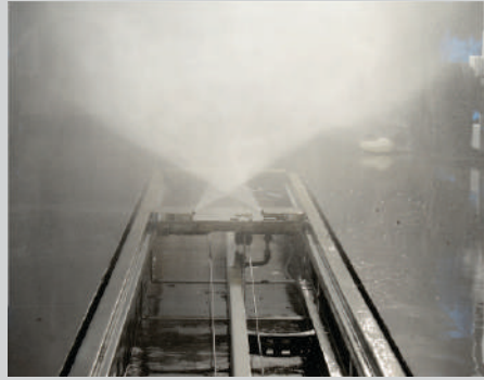
High operating pressure of 55 bar for effective cleaning